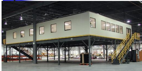
In Plant Modular Office