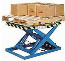
Dumper and Lifter Devices