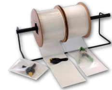
Poly bags in roll (printed or clear)