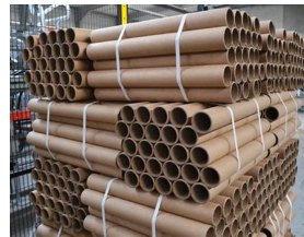
Paper tube core