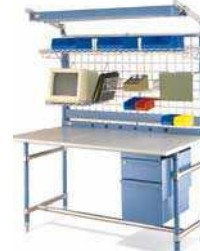
Modular Work Stations