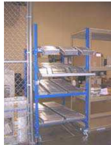
FIFO Portable Rack