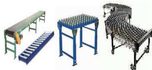
Belt and Roller Ball Transfer Accordion