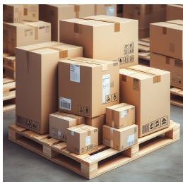
Corrugated Carton Box