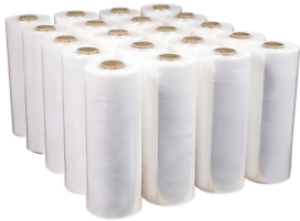
Machine Stretch Film