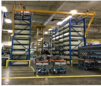
Stacker Storage System