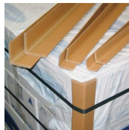
Cardboard corner protectors