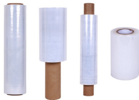
Manual Stretch Film